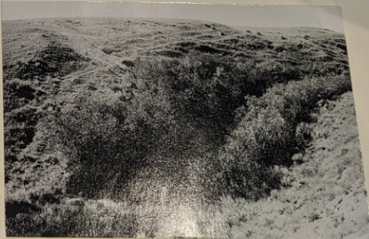
Figure 133: General view of possible Bison Kill at the head of the Stone Alignments, EcOp-61.