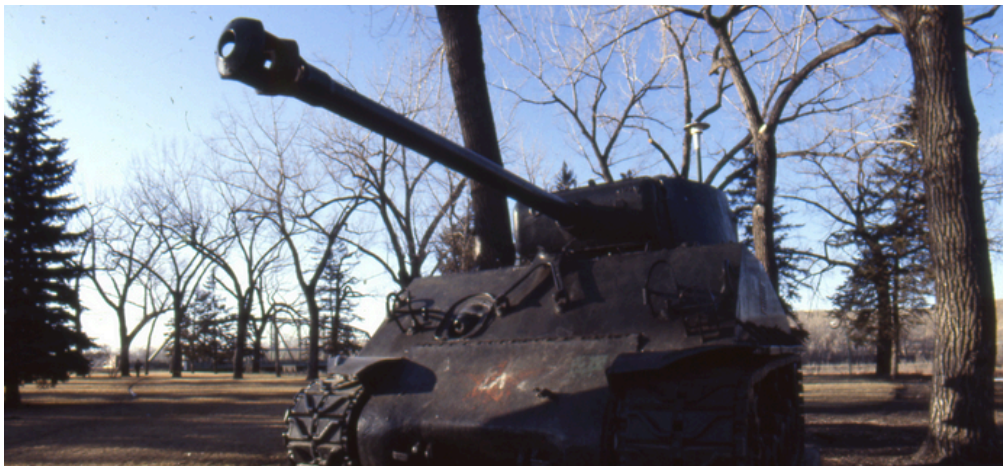
“Duffy” The tank in Riverside Veterans Memorial park, ca. 1980

Historical Society of Medicine Hat and District