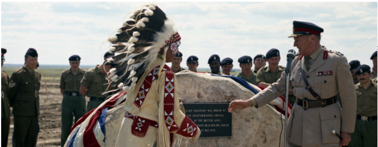
Archives Image 8689-A