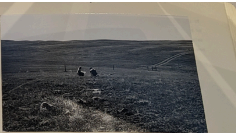
Figure 132: View looking south-southwest at mapping in progress, EcOp-61, Stone Alignment 1.

"1976 to 1980 Salvage Investigation" pg. 5